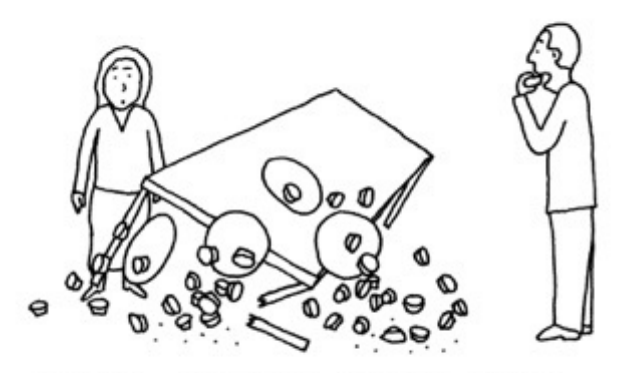
TABLES BUCKLING UNDER SHEER WEIGHT OF MINCE PIES