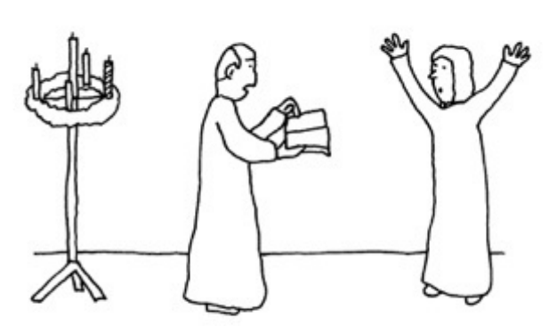
UNREST OVER THE CORRECT WEEK TO LIGHT THE PINK CANDLE