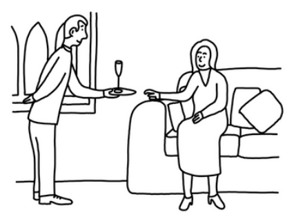
USE OF THE SECRET MEMBERS-ONLY LOUNGE